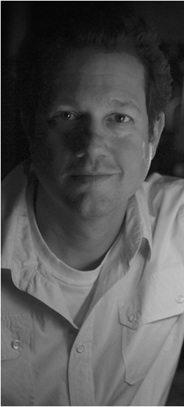
Michael Giacchino studied music composition at Juilliard and UCLA.